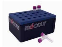
part # 60-24P