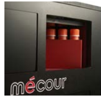
part # 60-48-2mL