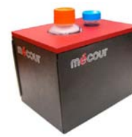
part # 60-250-50mL