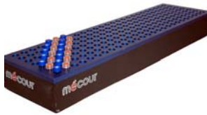
part # 60-182-2mL