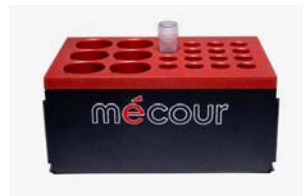
part # 60-50-2