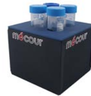
part # 60-4x50mL